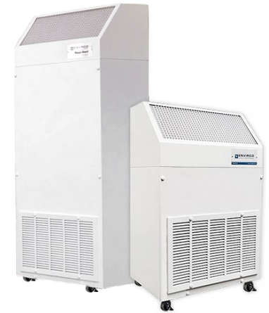
Hospi-Gard® IsoClean® 800

Room air, along with airborne contaminants, is drawn into the intake grille at the bottom while the purified air is discharged at a high velocity from the exhaust grille located at the top of the IsoClean® to generate a sweeping, low-to high air circulation pattern with adequate "reach" to optimize the clean breathing zone for patient and staff.