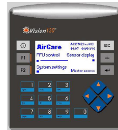
ACC7015 (Field Configurable)