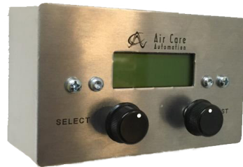
ACC1001 (Field Configurable)